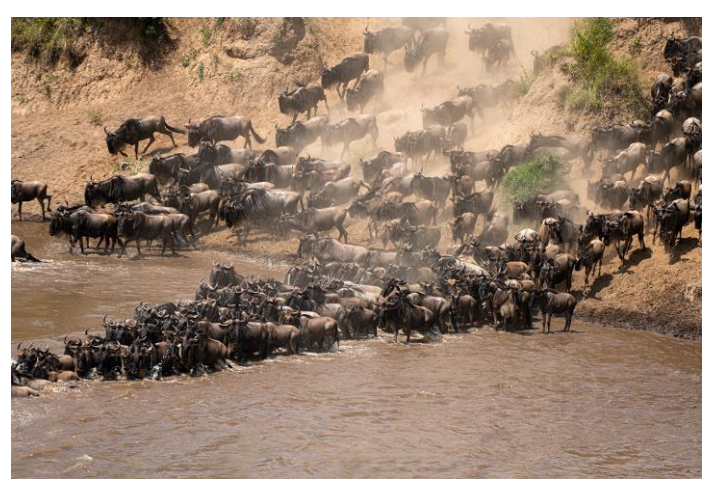
By Sze Wing Yiu