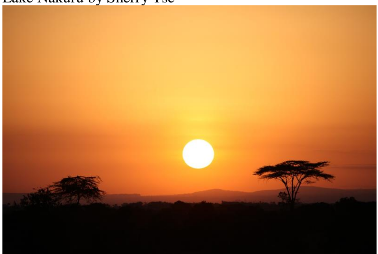
Sun rise in Kenya