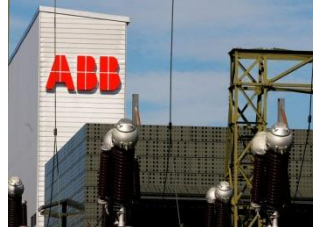
ABB India's Factory to Be Awarded Green Factory Building Certification By IGBC