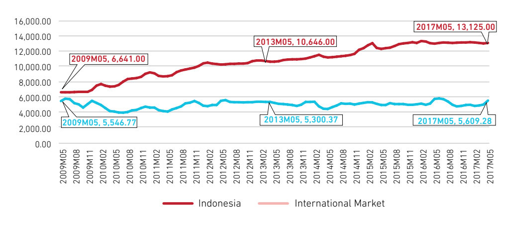
Figure 6 The Trend of Rice Prices in Indonesia and in International Market