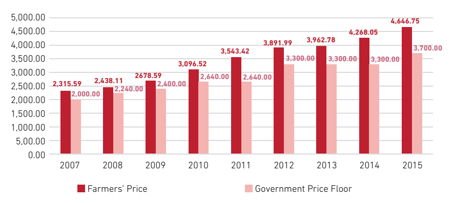
Figure 2 Yearly Average Prices of Harvested Rice Paddy (GKP) at the Farmers Level and Government Price Floor, 2007 – 2015

Sources are collated from Statistics Indonesia (2016) and Food Security Agency (2013)