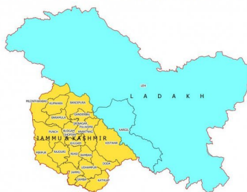
MAP OF UT OF JAMMU & KASHMIR AND UT OF LADAKH