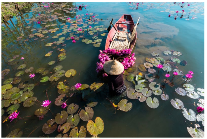
Photo Credit: Yen River with Rowing Boat Harvesting Waterlily in Ninh Binh, Vietnam by Vinh Dao - Canva

(equivalent to USD 2.7 billion) with 1,368 projects, accounting for 4.3 percent of BIDV's total outstanding loans and 13 percent of the total outstanding loans to the green sector of the whole economy.