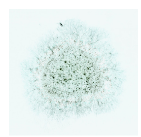
weiß René Schäffer, 2009

Ink jet pigment print in aluminium frame 1000 x 1000mm (40 x 40") £2,800