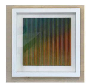
Stripe Landscape 3

Painting: Wood, Acrylic, Ink, Watercolour, Paint on birch wood panel 400mm x 400mm (16 x 16") £750