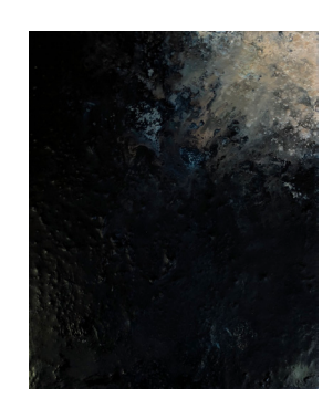
Night Light Peter Homan, April 2018

Framed oil and pigment, fired on canvas 800 x 1000mm (31 x 40") £1995