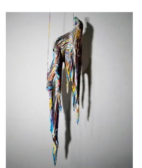
Squiddly Thing Sarah Louise Keber, 2019

Ink jet pigment print in aluminium frame 1000 x 1000mm (40 x 40") £2,800