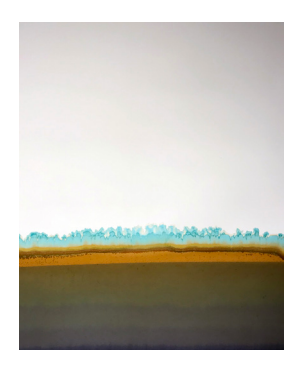
Unconformities 3 Felicity Bristow, 2019

Paper and pigment 595 x 850mm (23 x 34") £350