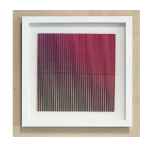
Stripe Landscape 2

Painting: Wood, Acrylic, Ink, Watercolour, Paint on birch wood panel 400mm x 400mm (16 x 16")