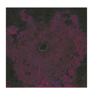
schwarz René Schäffer, 2009

Ink jet pigment print in aluminium frame 1000 x 1000mm (40 x 40") £2,800