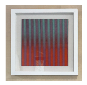
Stripe Landscape 1