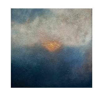
Muted Light Peter Homan, June 2017

Oil and gold leaf, fired on canvas Framed 650 x 650mm (26 x 26") £1675