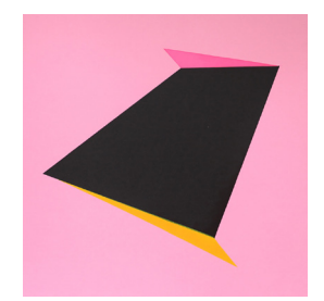
Pinkkk Luke Reidy, 2019

Oil and gold leaf, fired on canvas Framed 600 x 600mm (24 x 24") £1775