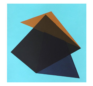
Yuppp Luke Reidy, 2019

Framed Screen Print 400 x 400mm (27 x 31") £380