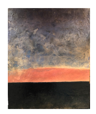
Sunrise on Sandy Mount Beach, Dublin Peter Homan, April 2019

Framed oil and pigment, fired on canvas 800 x 1000mm (31 x 40") £1995