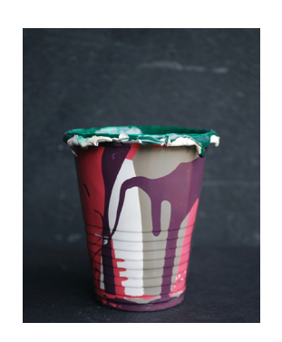
Cup Sarah Louise Keber, 2019

Layered paint sculpture 120 x 510mm (5 x 20") £800