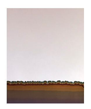
Unconformities 1 Felicity Bristow, 2019

Paper and pigment 595 x 850mm (23 x 34") £350