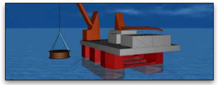
MOSES can compute motions and stability of any vessel or platform.

All three packages include the MOSES Solver and MOSES Language modules – the platform on which all analysis capabilities depend. The unique, generalized solver allows the consideration of all types of forces acting on the floating system, including hydrostatic, hydrodynamic, inertial,